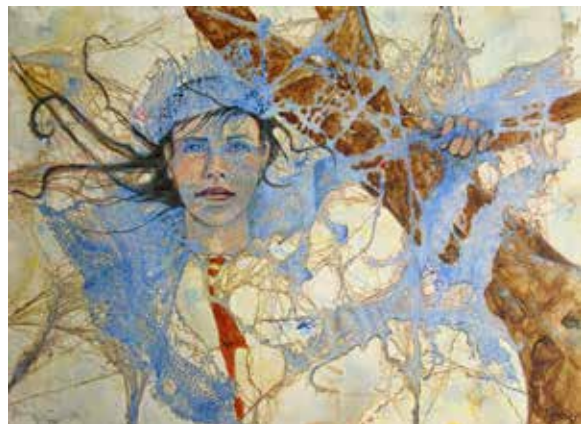
Honorable Mention "Vigil" Sally Mook