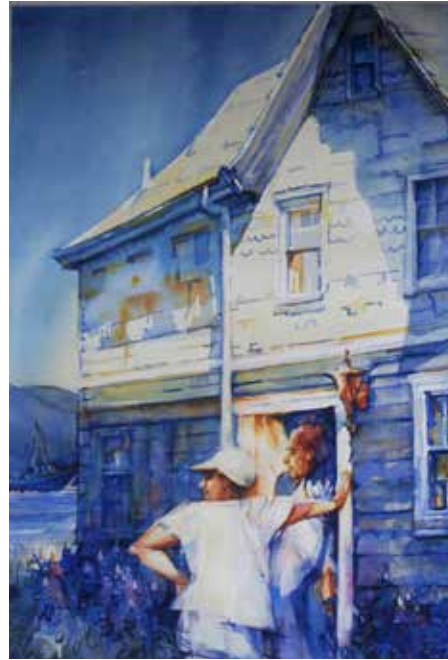
AWARD OF EXCELLENCE Morning Conversation Sandra Pealer