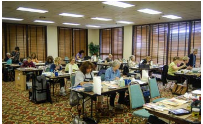
The group puts their lessons to good use.

But it went well the next day; therefore I have decided to do several pieces from my pictures that I have taken. Another class I will not forget.